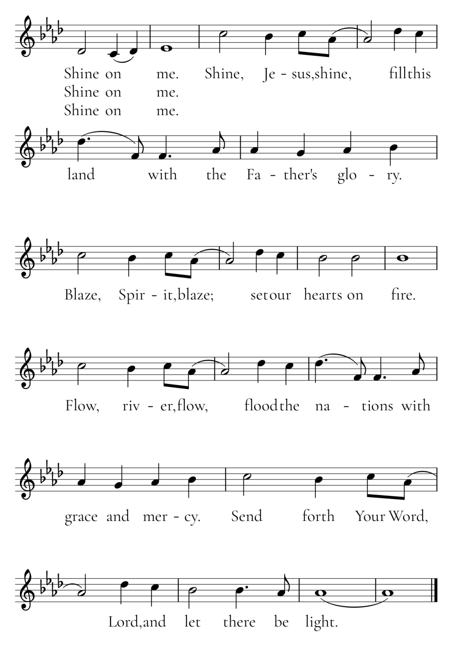
1987 Make Way Music